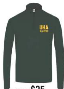
POLYESTER $35 QUARTER-ZIP PULLOVER