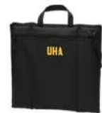
FOLDING BLEACHER SEAT $40 WITH STRAP AND UHA EMBROIDERY