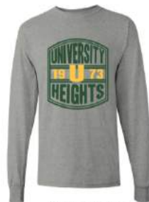
GILDAN GRAY $30 LONG SLEEVE