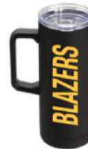
17 OZ INSULATED $25 STAINLESS STEEL MUG